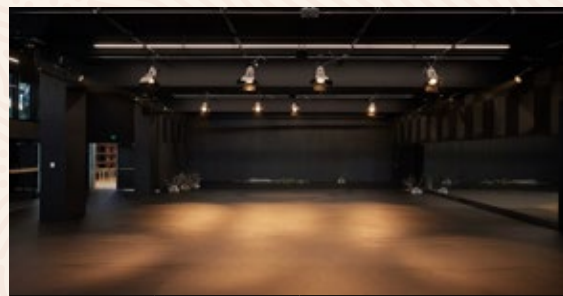
Studio 1 an additional 80 seats can be hired, bringing the total seated capacity to 200